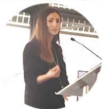
Building a relationship with the Mayor's Office

We hope that you agree that the venue was fantastic, spoilt only by the chaos on the Jubilee Line which we know prevented a few of our delegates from joining us. We guess that delays on the Underground will not be a new experience for our members!